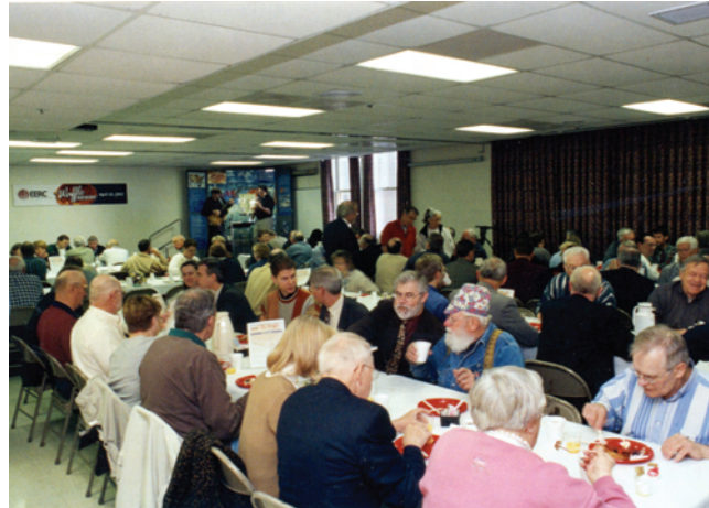
◀ Over 300 people attended a waffle breakfast at the EERC to publicly launch a 3-year study of the Waffle project.