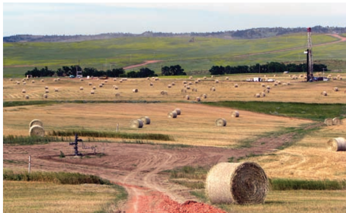
The Bell Creek oil field is located in southeastern Montana in the northern portion of the Powder River Basin. The oil is produced from sand bodies encased in shale at a depth of nearly a mile. These deep, isolated sands make ideal compartments for the safe long-term storage of CO 2 from human activities.

When natural gas comes from the production well, it can contain impurities like CO 2 and hydrogen sulfide (H 2 S), along with petroleum liquids like butane and propane. These constituents must be removed before the natural gas can be tied into a distribution pipeline or used by a customer. This cleanup is done at large facilities called natural gas-processing plants. There are more than 1300 natural gas-processing plants in the United States and Canada and nearly 1600 worldwide (PennWell, 2008, Worldwide gas-processing database). Because natural gas-processing plants are among the few sources of relatively pure streams of CO 2 , they are good candidates for carbon capture and storage projects that feature geologic CO 2 storage—the permanent storage of CO 2 from human activities deep underground. The Bell Creek project will use the CO 2 produced at the Lost Cabin gas-processing plant in central Wyoming in a commercial CO 2 EOR to CO 2 geologic storage project that uses CO 2 from gas processing.