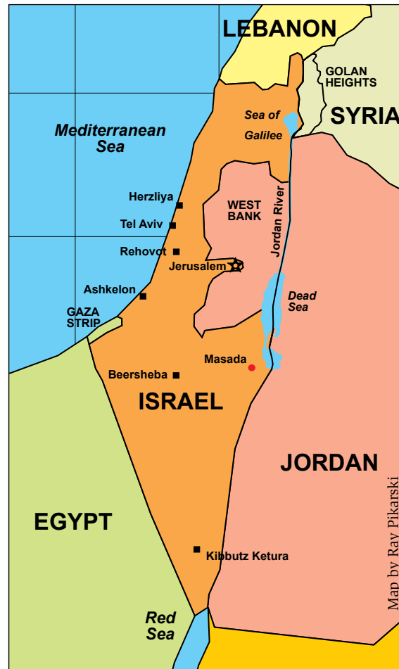
A map of Israel shows cities and sites visited by Groenewold during the delegation’s visit.

In mid-July, representatives from the Geological Survey of Israel visited the EERC. In Israel, Groenewold met with the Survey’s Director, Dr. Benny Begin, son of former Israeli Prime Minister