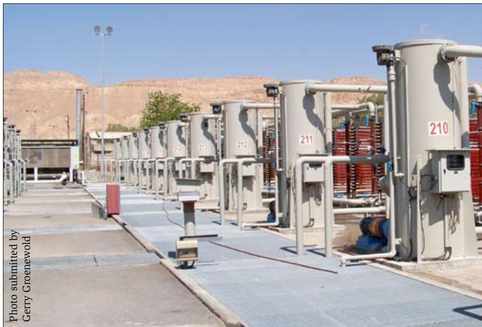
The algae facility at Kibbutz Ketura, 35 miles north of Eilat, which is at the extreme southern tip of Israel near the Red Sea. The Algatech biotechnology company cultivates pure cultures of the algae in a controlled, closed system and then transfers them to a modular tubular system exposed to long hours of natural sunlight for the final reddening process.

Menachem Begin. Dr. Begin proved to be well informed about the EERC’s Plains CO 2 Reduction Partnership, one of DOE’s seven regional partnerships formed to determine the best approaches for capturing and sequestering carbon dioxide and other gases believed to contribute to global warming.