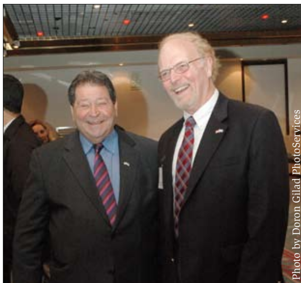
The Honorable Benjamin Ben-Eliezer (left), the Israeli Minister of National Infrastructures, and Groenewold share a laugh at a reception held for the delegation.

“I see nothing but expanded opportunities coming out of this,” said Groenewold. “We share many of the same energy insecurities that Israel does, and the partnerships that come out of this relationship will share expertise, information, and technology for the mutual benefit of both countries.”